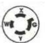
L 14-20 P