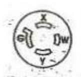
L 14-20 R